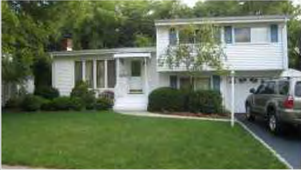
S1 Sample address