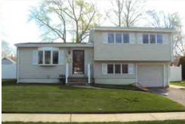
L2 Sample address